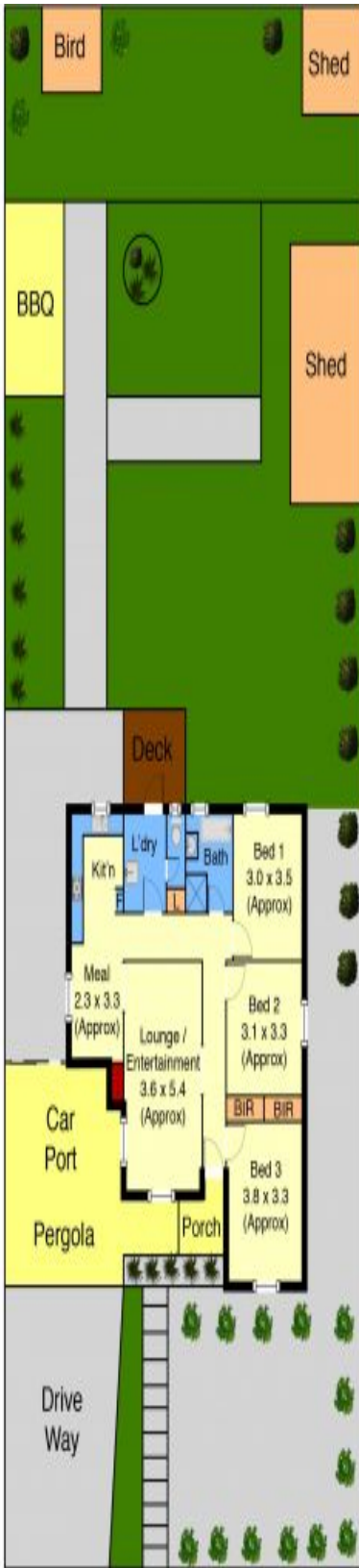
17 Quail Cres Melton